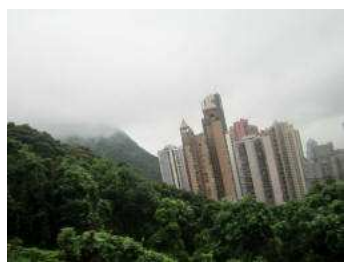
Sunday, April 29, 2012 ~ This morning after a nice buffet breakfast in the hotel, we had a Hong Kong Island Tour. We are staying in Kowloon, but we toured Hong Kong Island. First we took a one way tram ride up to Victoria Peak where we had great views and photo ops, plus great free WI FI at the local